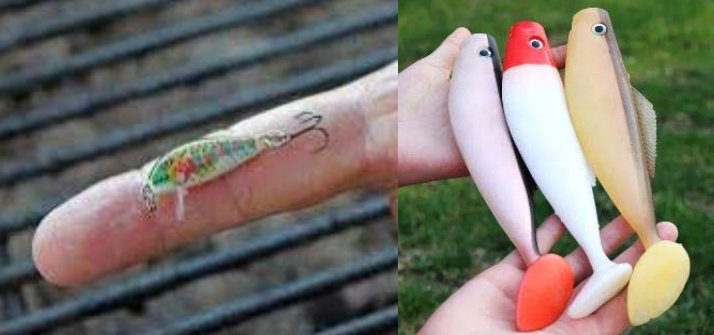
But, Let's not go Take into account the fish's